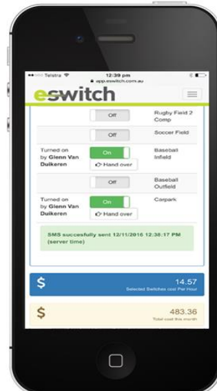
Handover feature allows continuous use by multiple users