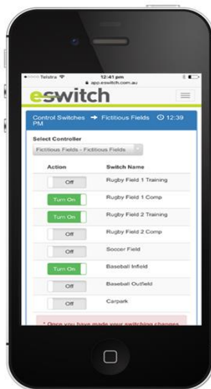
Turn field lights on and off from any location